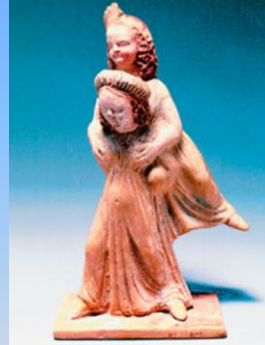
Girls Playing Ephedrimos, Hellenistic, ca. 300 B.C.E., Terracotta, The Metropolitan Museum of Art, New York, New York